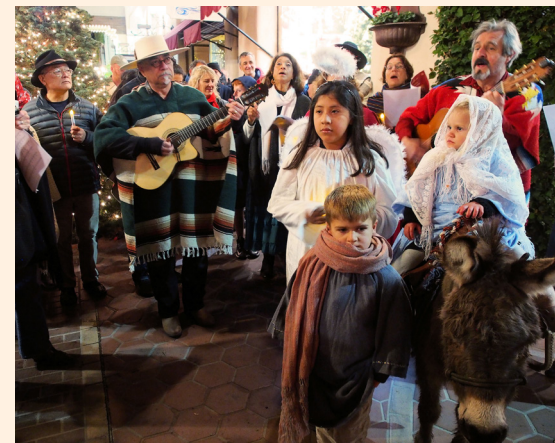
El Coro sings at a stop along State Street during the 2016 Una Noche de Las Posadas .