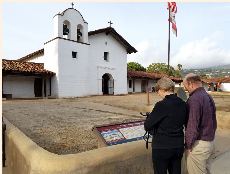
New interpretive sign at El Presidio SHP.

I also want to draw attention to two ongoing, standout programs from SBTHP. In 2016, the editorial team of staff and board members produced another stellar four issues of our membership publication, La Campana . This forty-page, full-color print publication includes a combination of research articles and news about our work. It is a tremendous undertaking and a rigorous production schedule for our small team, and we are proud to be able to continue this valued service for our membership.