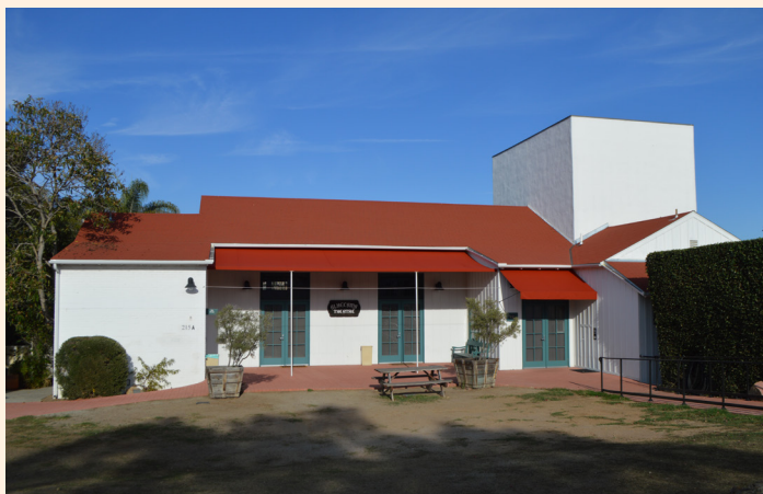
Recently completed exterior improvements at the Alhecama Theatre including an accessible ramp (at right) and new canvas awnings.