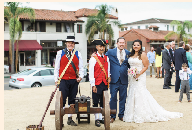
Soldados pose with a newly married couple after firing the cannon outside the Presidio Chapel.