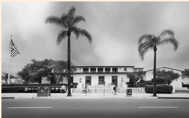
Santa Barbara Downtown Post Office as featured in the Building Community exhibit.