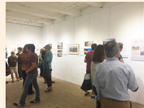
1st Thursday at Casa de la Guerra for the Building Community exhibit.

SBTHP saw an increase in facilities rentals this year with a total of sixty-nine events, including twenty-nine weddings, seventeen wedding receptions, sixteen co-sponsored and non-profit events, and seven corporate rentals.