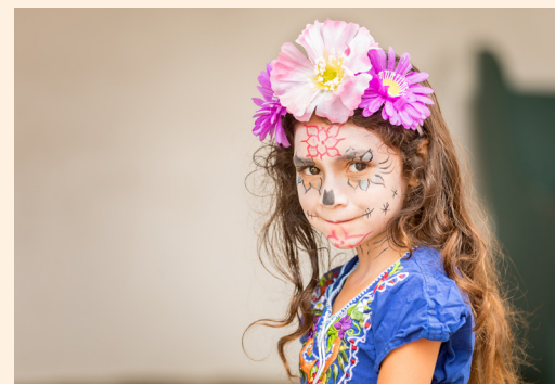
A young girl pauses after getting her face painted at our annual Día de los Muertos Craft Day at Casa de la Guerra.