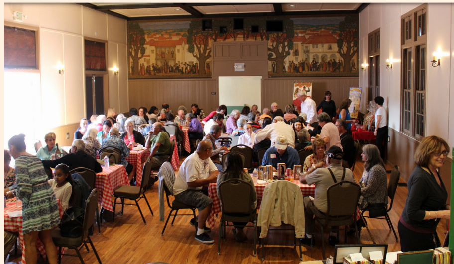
2016 Presidio Descendant's Luncheon.

We also have much to look forward to in 2017. SBTHP will be undertaking its first ever comprehensive strategic planning process in the new year. This process will bring SBTHP's many goals and projects into alignment with organizational structure, audiences, and partners and will set specific objectives for upcoming years. We are also proud to be a partner in the History Relevancy Project, an initiative with University of California, Santa Barbara and California State Parks, designed to develop new interpretive training modules that can be exported to other California State Historic Parks. We are welcoming State Parks interpretive staff, and UCSB undergraduate and graduate students to El Presidio SHP to pilot new concepts at programs throughout the year.