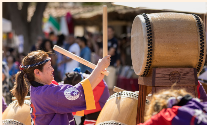
A taiko drummer from Togen Daiko of Oxnard Buddhist Temple solos in front of the Presidio Chapel at the 2016 Asian American Neighborhood Festival.

In 2016 SBTHP also offered a series of lectures and the Asian American Film Series at the newly renovated Alhecama Theatre. Holiday programs, Día de los Muertos Craft Day and Una Noche de Las Posadas allowed families to participate in traditions that make Santa Barbara and its cultural history so distinct.