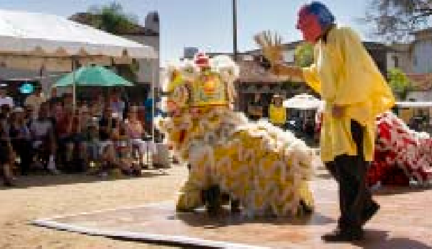
Spectators at the Asian American Neighborhood Festival enjoying the Lion Dancers.