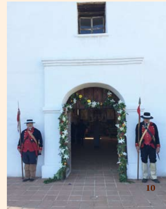
Soldados stand at attention at a wedding at the Presidio Chapel.