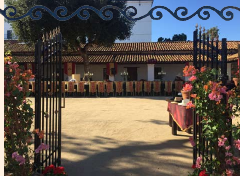
A corporate event in the courtyard of Casa de la Guerra.