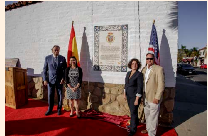
Unveiling the Prince's Plaque at the Presidio Northwest Corner defense wall.