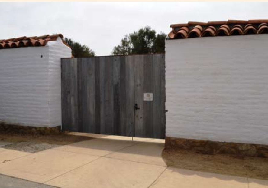
Northwest Corner gate.