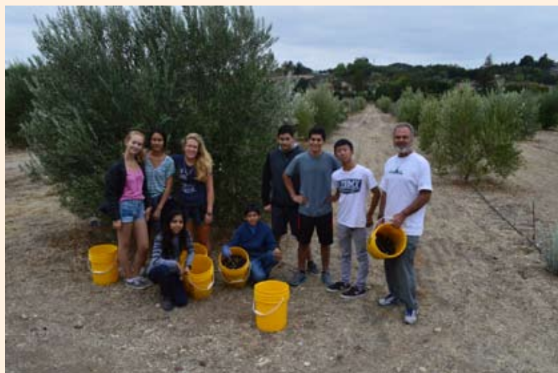
Anacapa School students picking olives at the Mills, October, 2015.