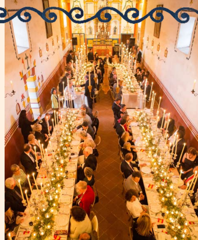
Candlelight dinner in the Presidio Chapel.

It has been a bright year thanks to our friends and members who truly illuminate Santa Barbara and support SBTHP's mission to preserve the city's unique history.