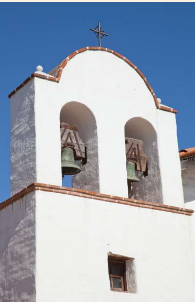
El Presidio de Santa Bárbara State Historic Park