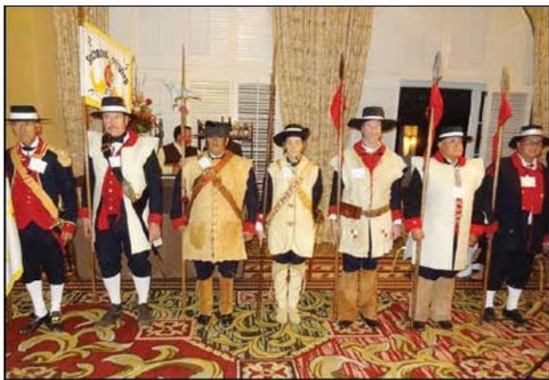
Reenactment soldados in full regalia for the heir to the Spanish throne Prince Felipe's visit to Santa Barbara