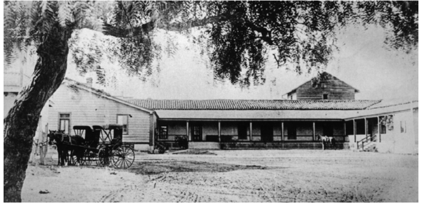
ABOVE: The Casa Victorianized. Note the sparse landscape.

In 1990, the Santa Barbara Trust for Historic Preservation began conducting exhaustive archaeological and documentary research to determine the structural history of the Casa, with particular emphasis on its original configuration. The Casa has been restored to its appearance during the time José de la Guerra resided there, a 30-year period between 1828 and 1858. Wherever possible, historic fabric was protected in the restoration process, and materials and building methods similar to those originally used were employed. For instance, pine timber for door and window lintels, roof beams, etc. was logged in the Los Padres National Forest, stripped of its bark and, where appropriate, hand-adzed for use in restoring the Casa.